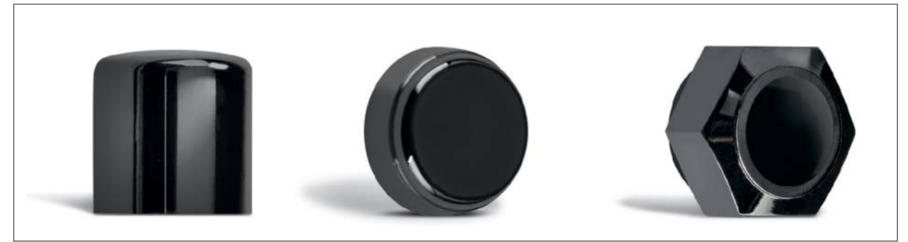
Fig. 2 Precision watch parts with high surface finish and esthetic requirements

shasanovic@ceramaret.ch www.ceramaret.ch