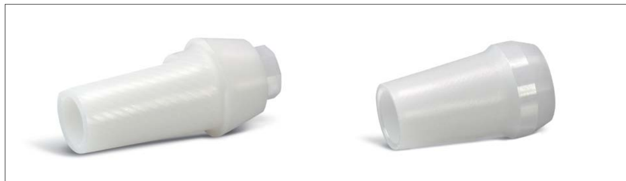
Fig. 1 Complex shaped dental implant abutments

With over 100 years of experience, Ceramaret has built a solid reputation for the reliability and quality of both its ceramic parts manufacturing and the service it provides. Our customers can rely on a solid engineering team to support and guide their designers at the very earliest stages of new ceramic projects. The time to market can be significantly reduced if the first prototypes are functional and do not require multiple iterations before the final design is reached.